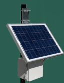
Solar DCAP Kit